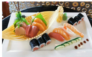
Sushi and Sashimi Combo