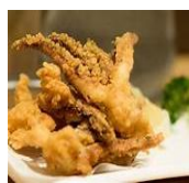
Deep Fried Squid