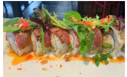
SUSHI AND STEAK ROLL