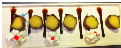
Baked Japanese Sweet Potato