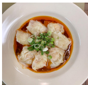
Shrimp Spicy Wonton