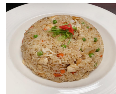
Chicken Fried Rice