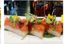
Spicy Tuna Crispy Rice