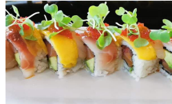
AUTUMN LEAVES ROLL