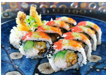
NIKKI HOUSE ROLL