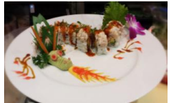
FIRE DRAGON ROLL