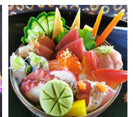
Sushi & Sashimi Combo