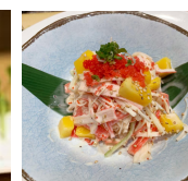
Spicy Crab Salad