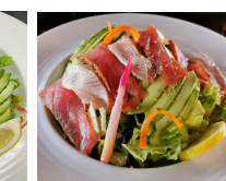
Nikki Sashimi Salad