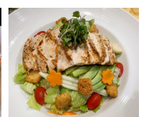
Grilled Chicken Salad