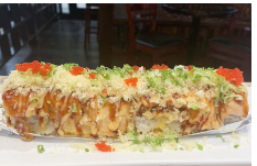
HOT SAMURAI ROLL

Price subject to change without notice. Please let us know if you have allergies or food sensitivities.