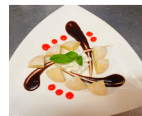
Mochi Ice Cream