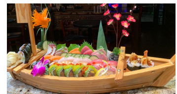
NIKKI LOVE BOAT