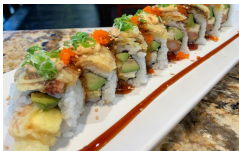
NINJA TURTLE ROLL