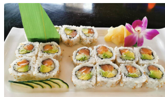
Lunch Maki Combo