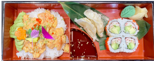
Lunch Sushi Bento