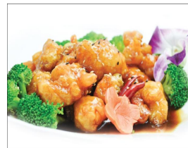
Spicy Orange Chicken