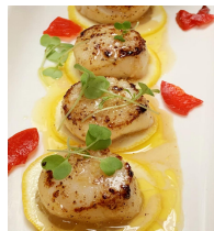
Pan Seared Scallops

Japanese style BBQ w/onion, cabbage carrots ,yakiniiku sauce.