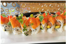
DOUBLE SALMON ROLL