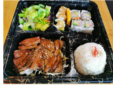
Lunch Beef Teriyaki Bento